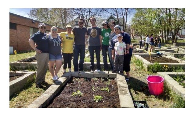
Public Health Student Organization tending to the community gardens in Hartford

https://www.facebook.com/UCONN.PHS O/videos/vb.80469869525/1015405739 8719526/?type=2&theater