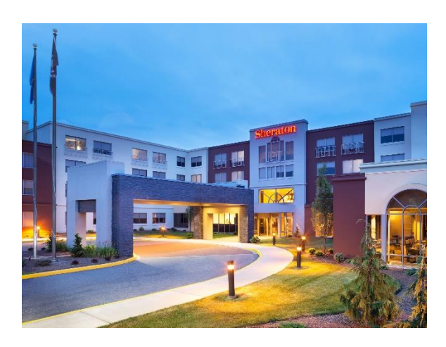
Location: Sheraton Hotel Hartford South 100 Capital Blvd, Rocky Hill, CT

Promoting Public Health in Connecticut Since 1916